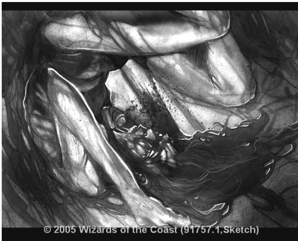
Mortify sketch by Glen Angus

Thirteen years later, Glen Angus submitted this sketch for the Orzhov guild's flexible removal spell, Mortify :